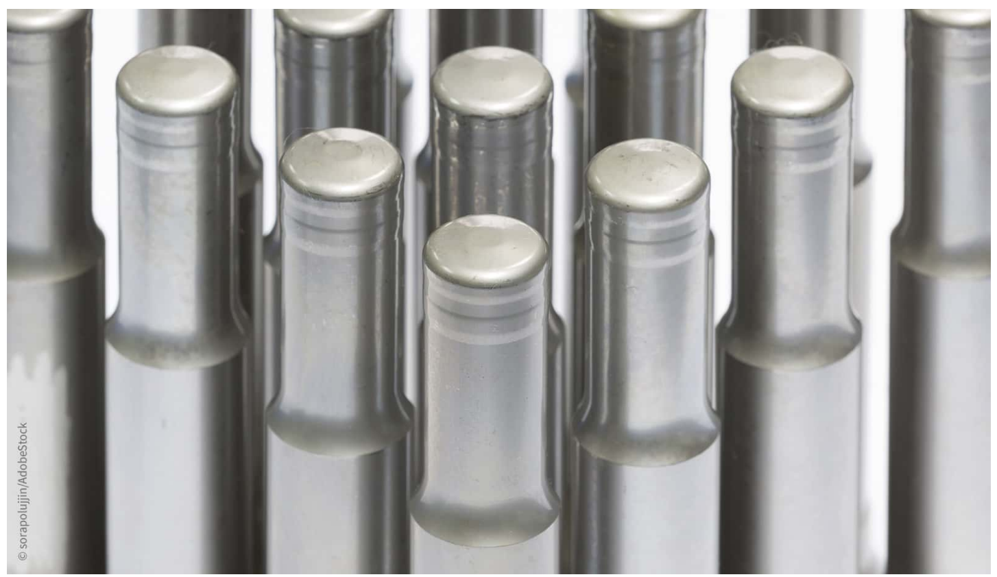
Milling punches from carbide: CCDia<sup>®</sup>CarbideSpeed<sup>®</sup> ensures excellent surface finishes.