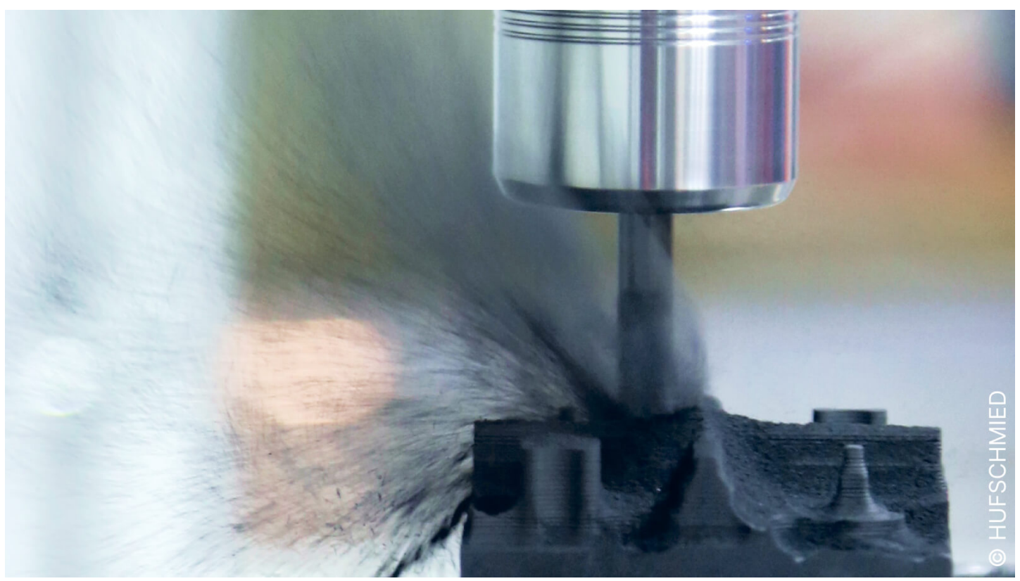
Diamond coatings from CemeCon offer the ideal solution for milling graphite electrodes

For the production of injection molds, tool and mold makers today rely not only on die-sinking EDM with copper or graphite electrodes, but also on direct milling thanks to technological advancements. Which process is used depends, among other things, on the requirements, such as the complexity of the contours, and also on the available resources: "All machining options have one thing in common: Only high-performance cutting tools can meet the requirements for precise, economical and process-reliable production. This applies both to the production of the electrodes from graphite or copper and to the milling of the steel or carbide itself," says Manfred Weigand, Product Manager Round Tools at CemeCon. "With our HiPIMS and diamond coatings, we offer the suitable solution for every application."