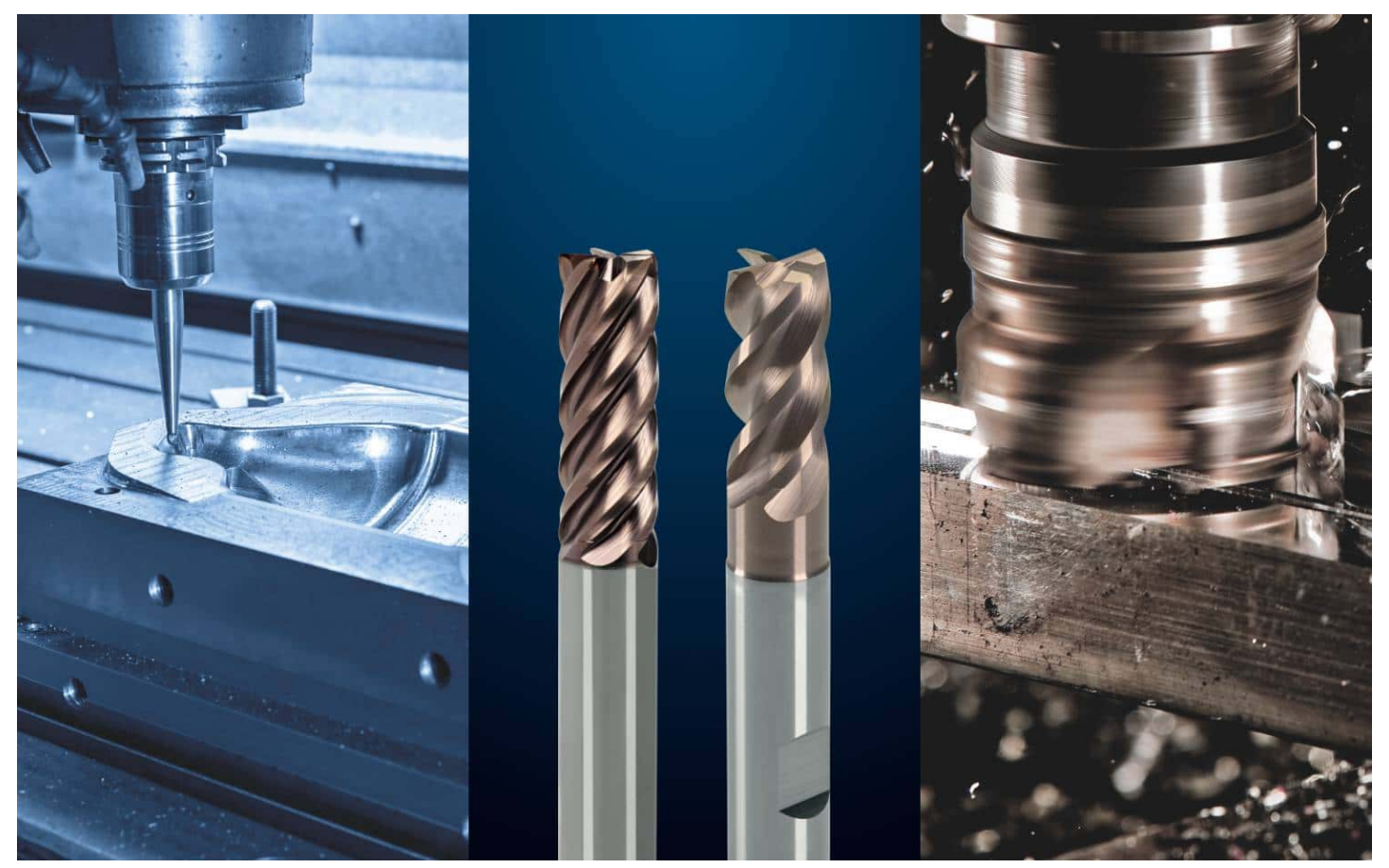
SteelCon® (left) and InoxaCon® (right): Hard to distinguish from the outside, but different on the inside. The layer properties determine the respective area of application