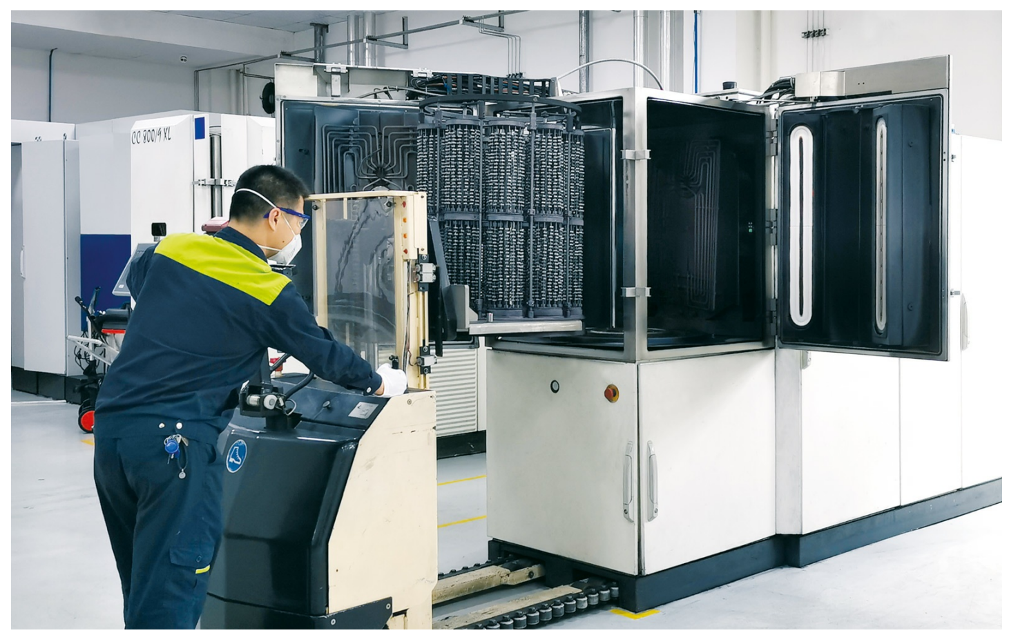
Huarui has been using sputter systems for coatings for a long time. To increase the performance of their inserts even further, Huarui is now investing in a CC800<sup>®</sup> HiPIMS.