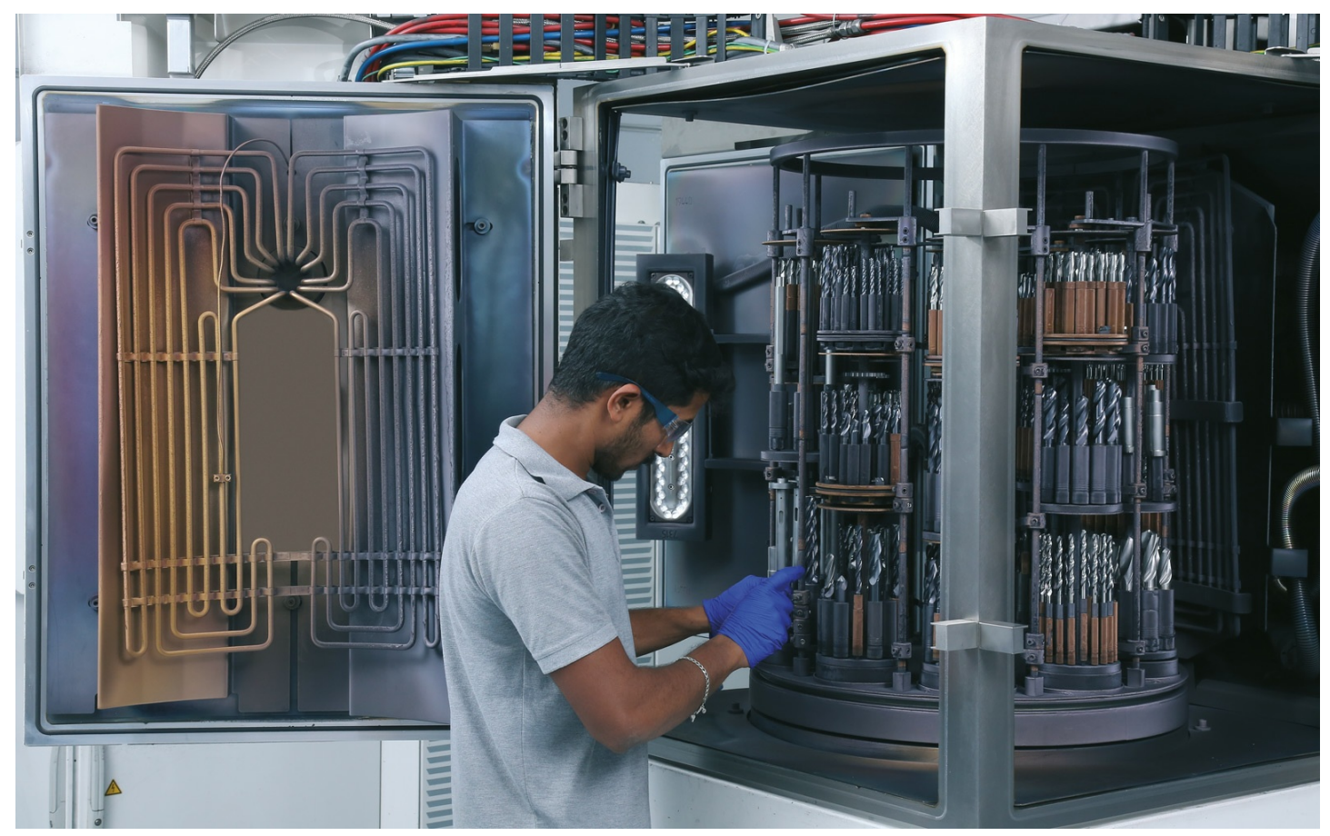
With the CC800® HiPIMS, AddLife is expanding its capabilities and opportunities of extending its market position.