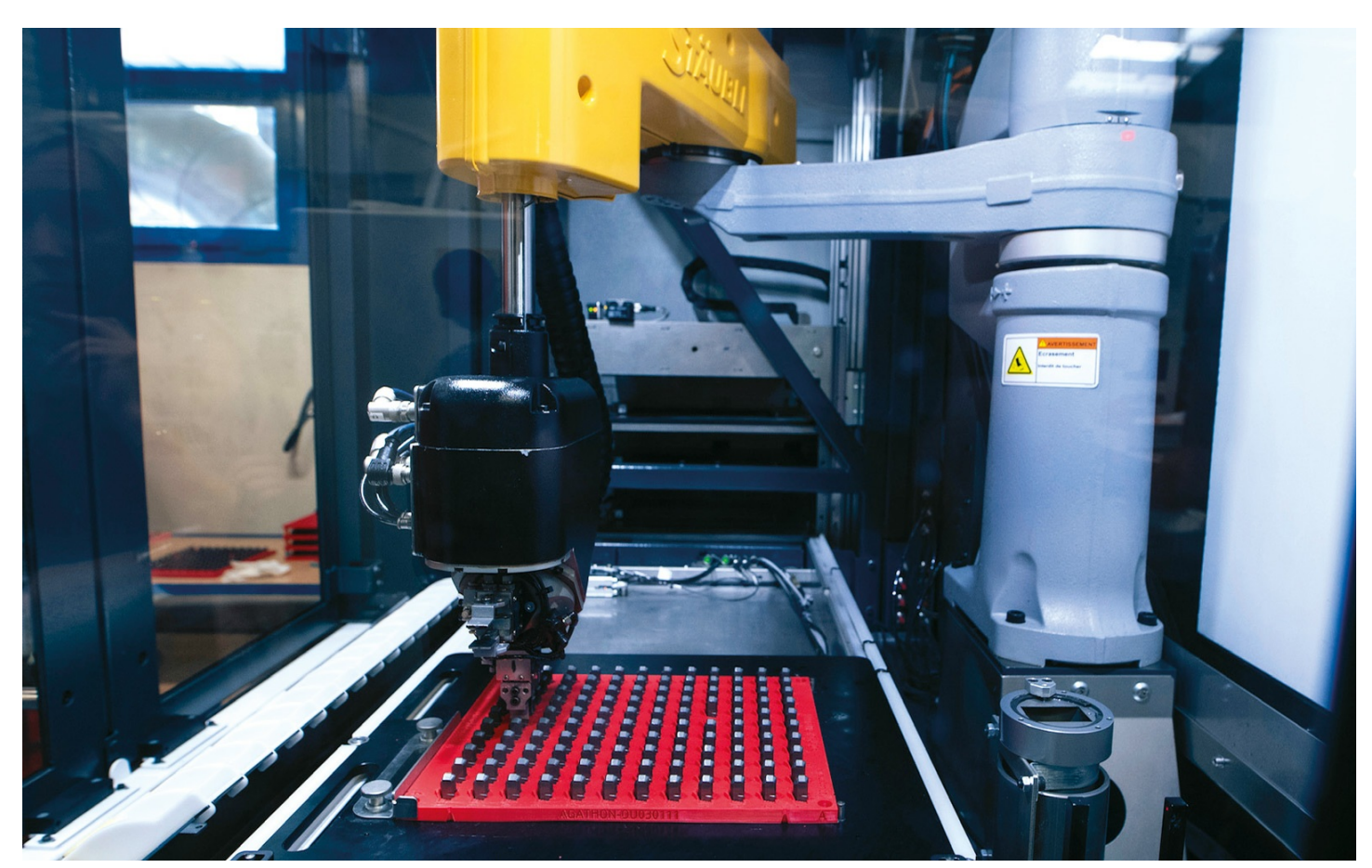
PY INDUSTRIE produces cutting inserts with uncompromising quality requirements. For consistently high coating quality, they have found a competent and reliable partner in CemeCon.

PY INDUSTRIE's main concern was to find solutions for processing stainless steels, aluminum and titanium. With their Premium Plus service and close collaboration with the French insert manufacturer, CemeCon adapted the coatings to the French company's exact requirements. "We guarantee our customers high-performance inserts in all applications. That is why we checked the quality and performance of the different coating solutions in several samples at CemeCon – and the very good machining results have fully convinced us. AluSpeed®, for example, has been very successful for aluminum machining," says Guidolin.