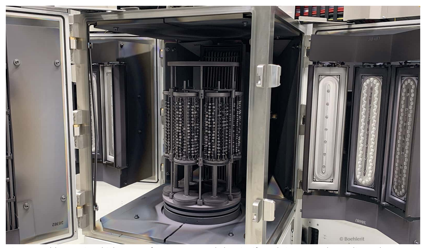
HiPIMS enables coating thicknesses of up to 12 \mu m and also significantly increases the quality and performance of the coatings.