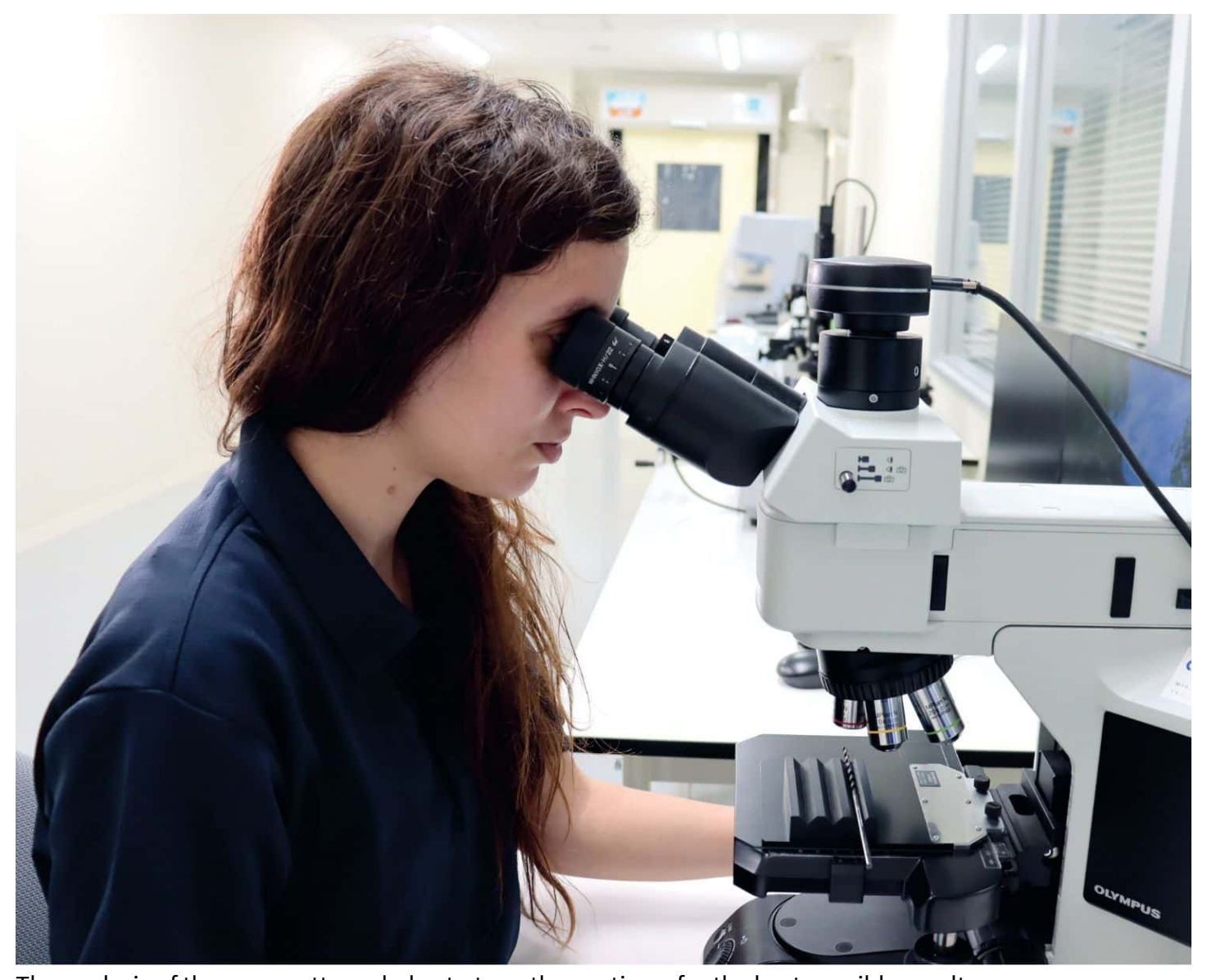
The analysis of the wear patterns helps to tune the coating – for the best possible result.