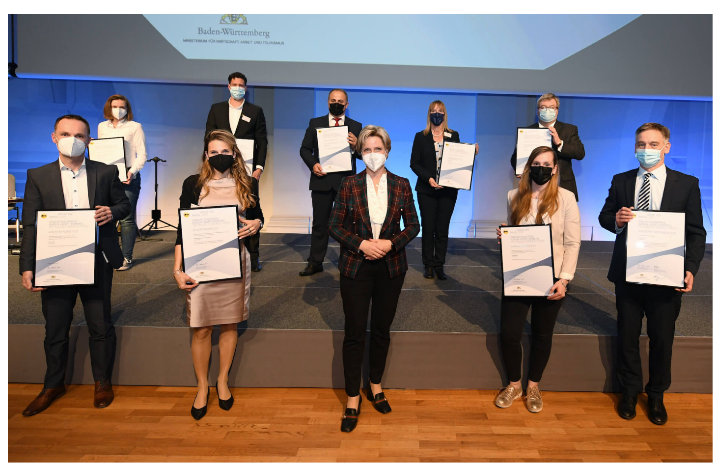
At the award ceremony for the Innovation Prize of the State of Baden-Württemberg