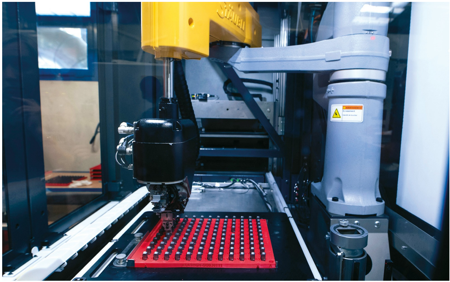
PY INDUSTRIE produces cutting inserts with uncompromising quality requirements. For consistently high coating quality, they have found a competent and reliable partner in CemeCon.

PY INDUSTRIE's main concern was to find solutions for processing stainless steels, aluminum and titanium. With their Premium Plus service and close collaboration with the French insert manufacturer, CemeCon adapted the coatings to the French company's exact requirements. "We guarantee our customers highperformance inserts in all applications. That is why we checked the quality and performance of the different coating solutions in several samples at CemeCon – and the very good machining results have fully convinced us. AluSpeed®, for example, has been very successful for aluminum machining," says Guidolin.