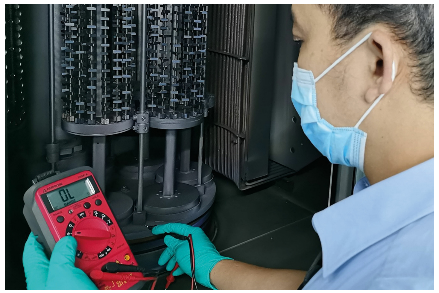
More performance and tool life for GESAC milling inserts – thanks to HiPIMS.