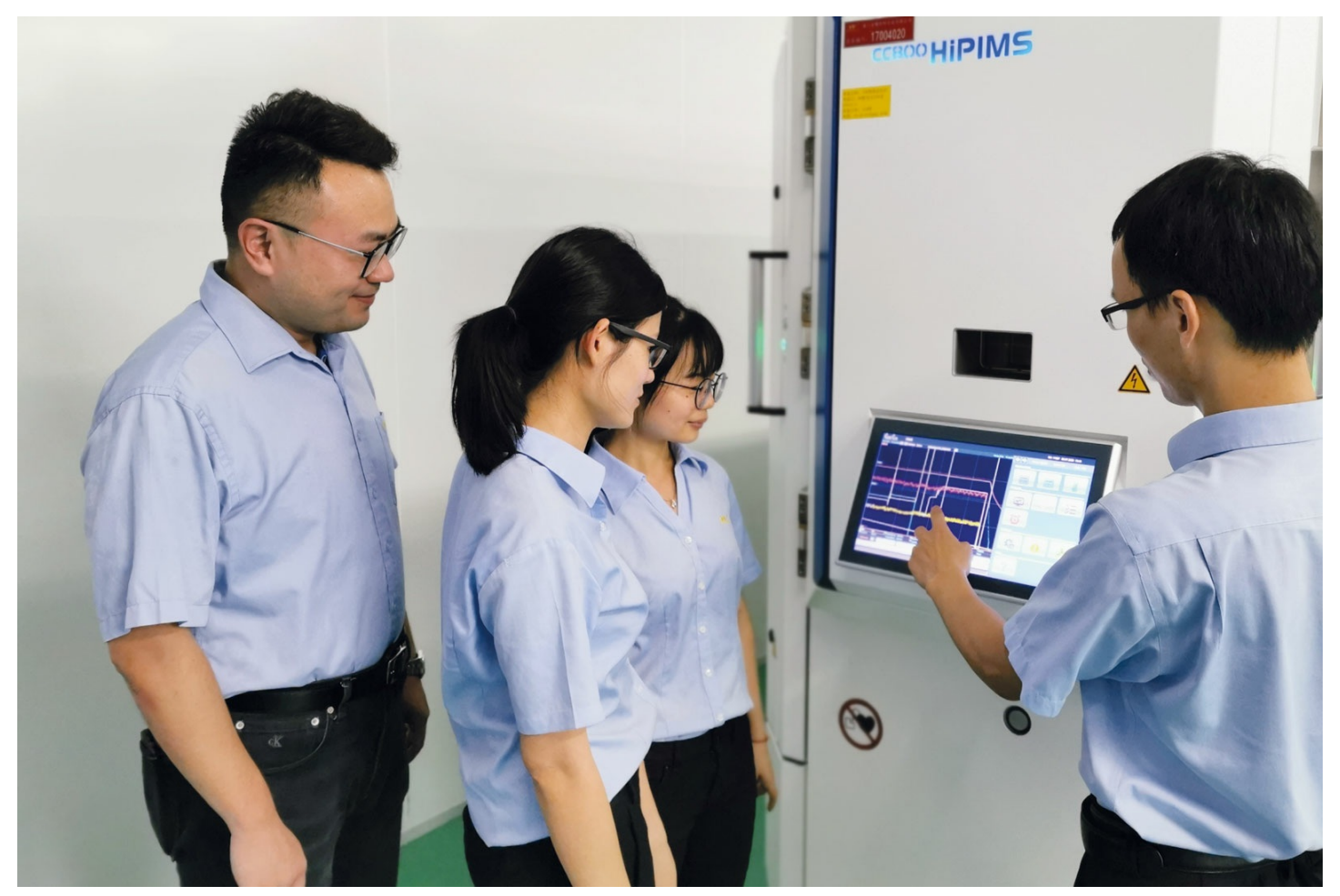
The GESAC development team is enthusiastic about the possibilities of the CC800® HiPIMS.