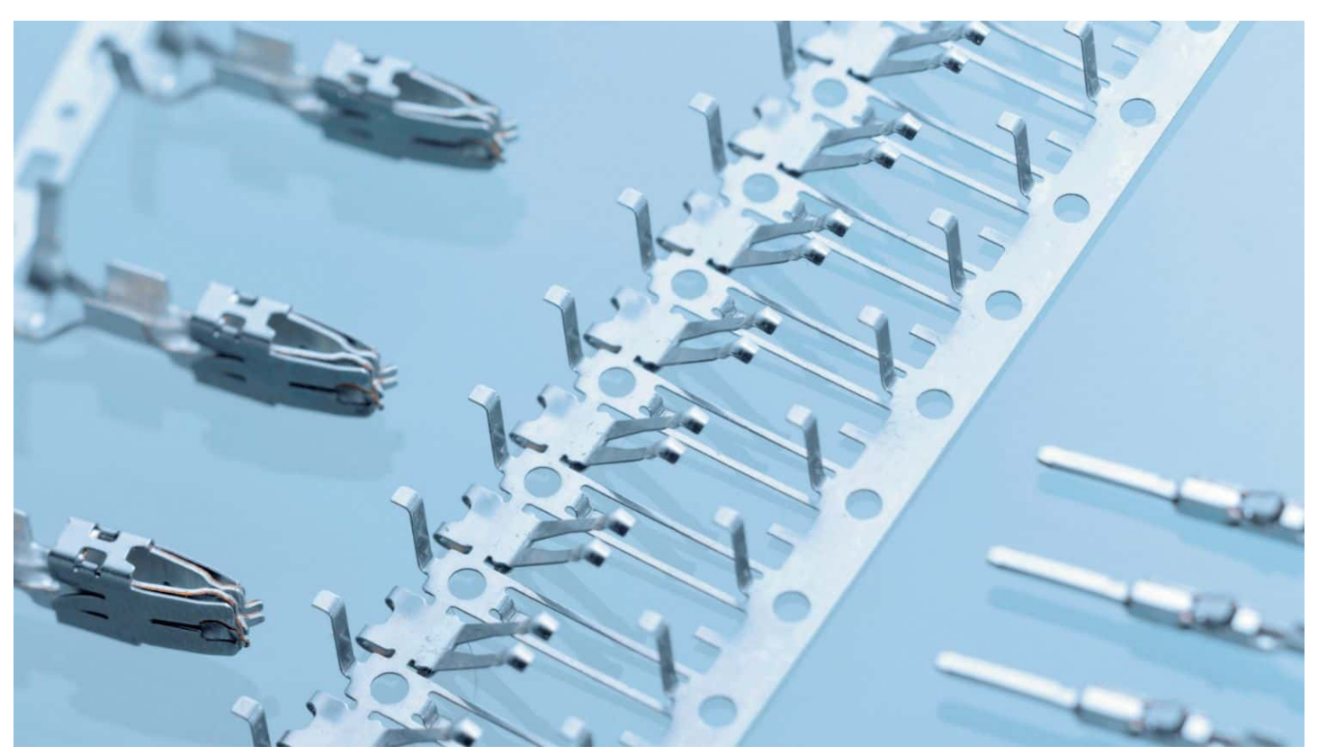
Sophisticated stamped parts for the electronics industry are the core competence of Stepper.