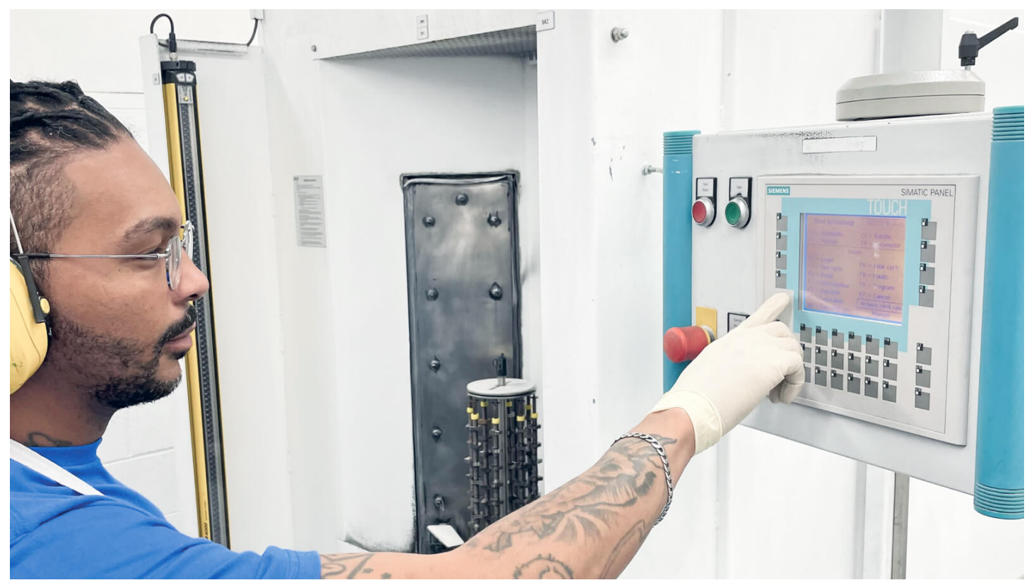
In the coating center, the CemeCon team works every day with the same technology that is installed at customers' sites