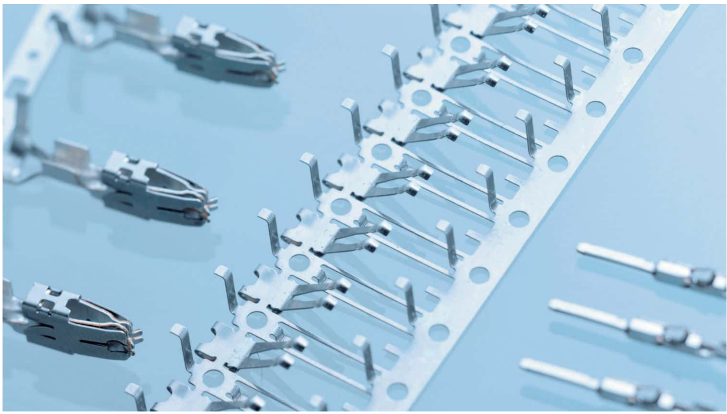
Sophisticated stamped parts for the electronics industry are the core competence of Stepper.