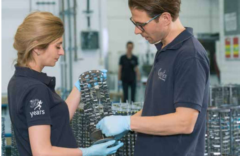
All cutting inserts are provided with dedicated coatings.

CemeCon clearly differentiates between the individual requirements for these. Premium Service focuses on the unique form and function of each tool, while Premium Plus solutions involve CemeCon's experts working closely with the tool manufacturer to design a coating solution that is precisely tailored to market requirements.