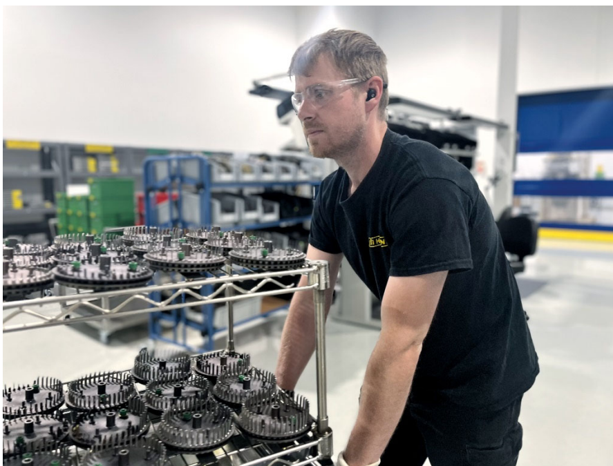
The transition to in-house coating production went completely smoothly at HORN USA – thanks to CemeCon training.