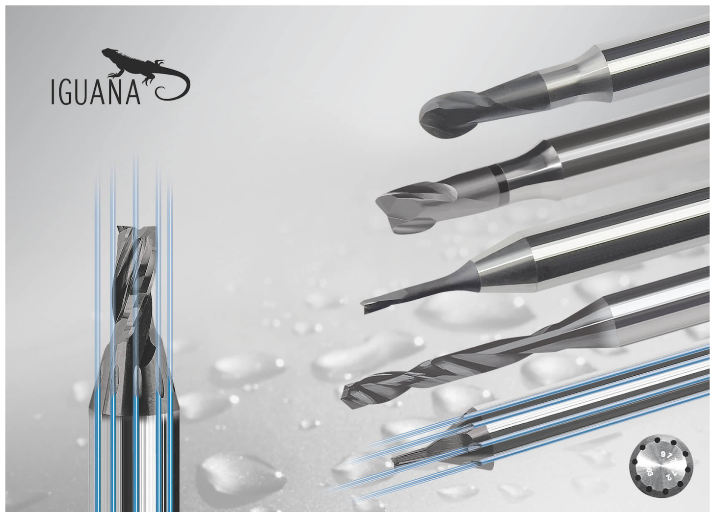
With the IGUANA tool family, ZECHA is revolutionizing the market for diamond tools in the micro range.

The high thermal conductivity of the diamond coating ensures rapid heat dissipation. This is enormously important when machining temperature-sensitive materials such as CFRP and GFRP and enables a higher machining speed during cutting. The diamond coating has been perfectly tailored to the geometry and material properties of ZECHA tools and to the machining of abrasive materials. ZECHA uses carbides specially suited for this purpose as well as specially developed tool geometries, some of which are patented.