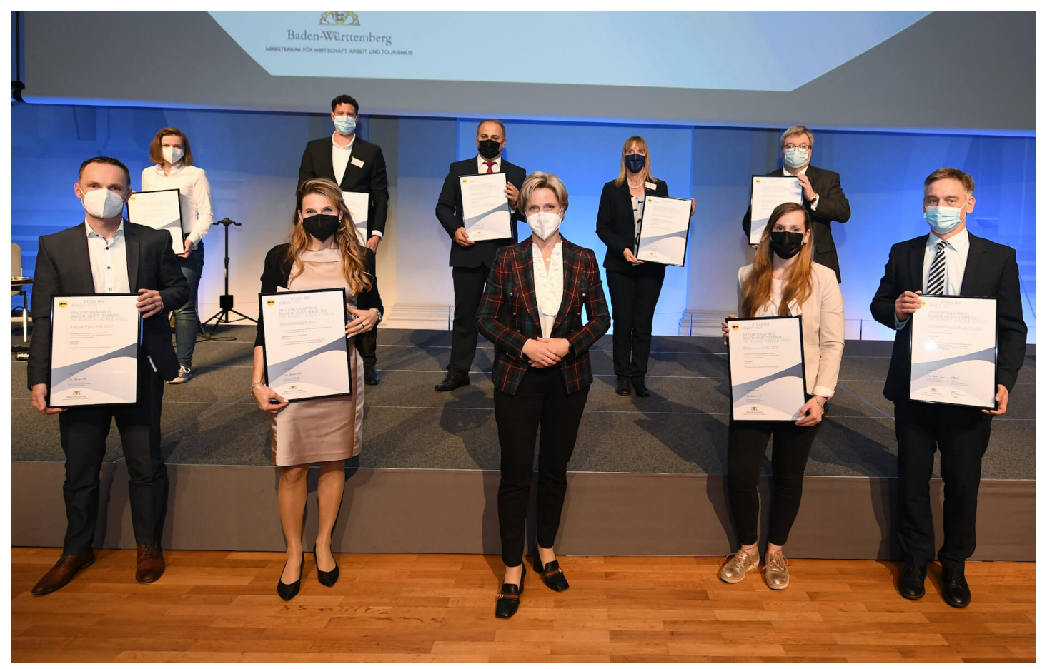
At the award ceremony for the Innovation Prize of the State of Baden-Württemberg