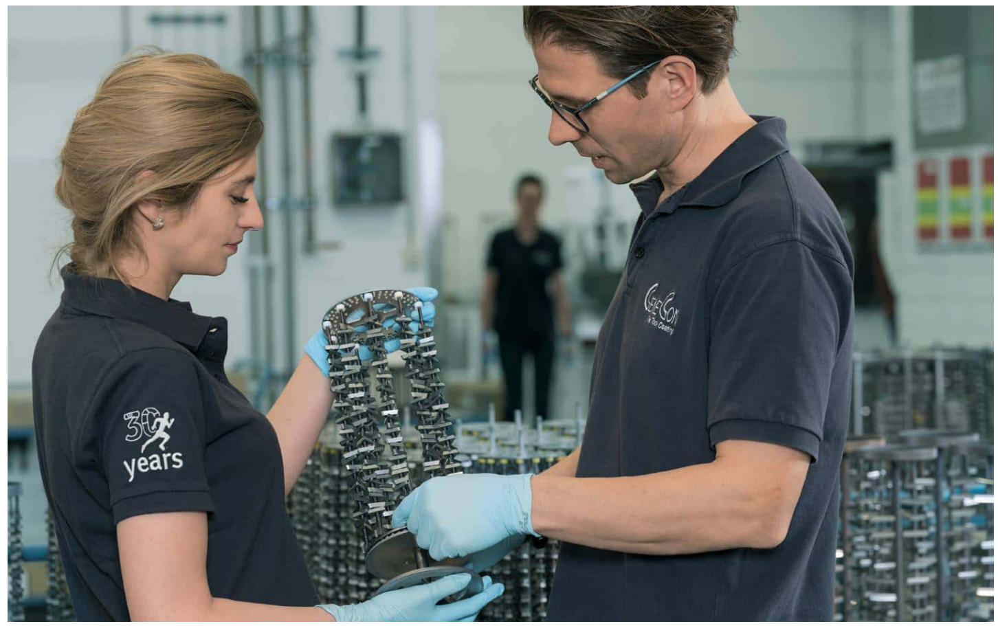
Quality assurance is part of the coating process at CemeCon right from the start