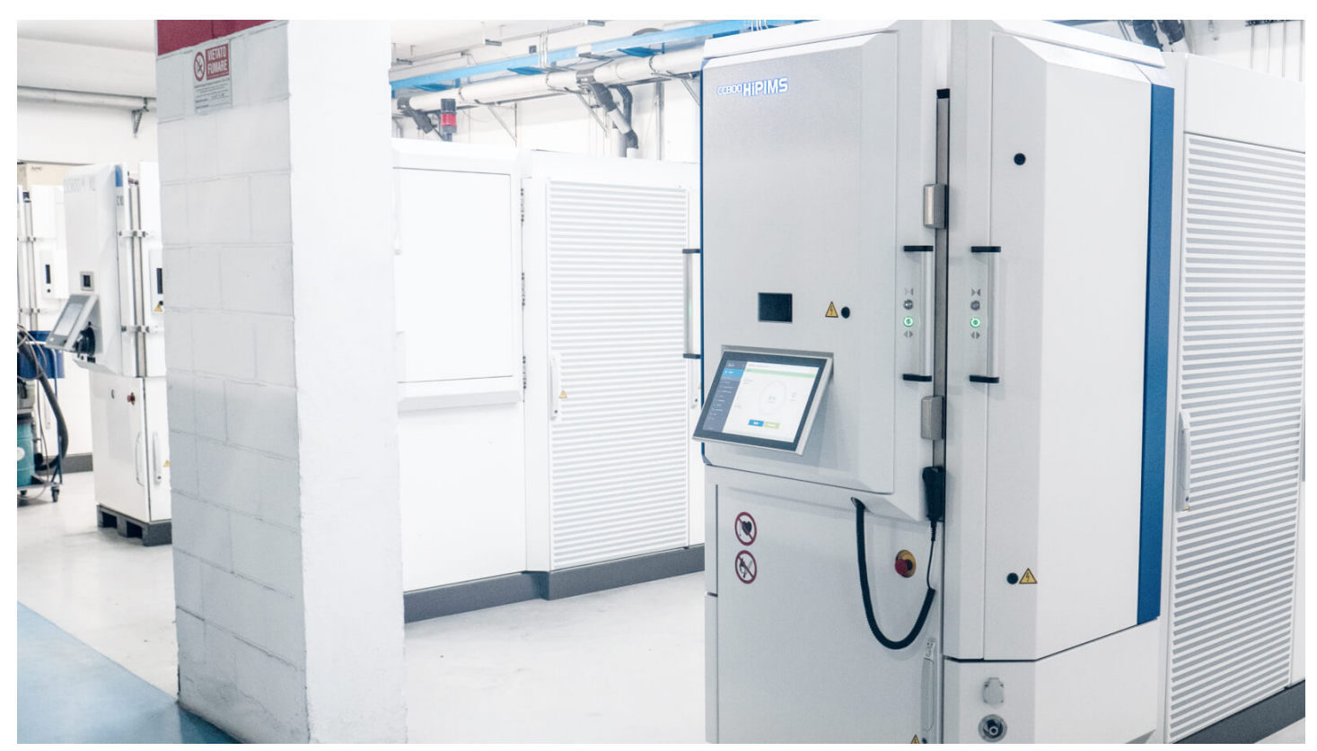
With HiPIMS technology, Lafer has taken the long-standing collaboration with CemeCon to the next level