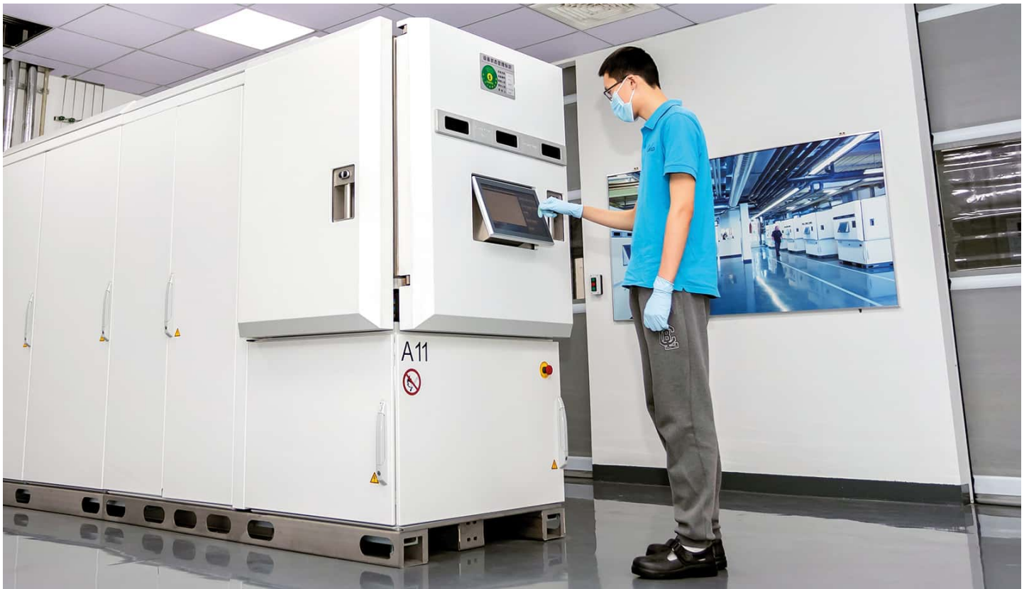
Diamond coatings for CFRP machining now available from CemeCon in China.

“In China, the machining of fiber-reinforced plastics is becoming increasingly important - whether for alternative drive concepts or sports articles. This is reason enough to expand our Chinese offering in this area. Since December 2020, tool manufacturers can have their precision tools coated with the diamond coating materials CCDia®FiberSpeed® and CCDia®MultiSpeed directly in our coating center in Suzhou. This opens the way to economical and precise machining of fiber-reinforced plastics, hypereutectic aluminum and ceramics,” says Jimmy Zhang, Sales Manager at CemeCon in China.