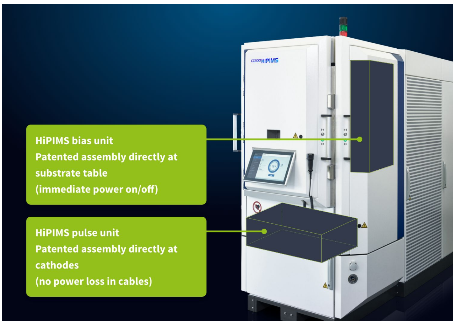
Full power into the plasma through lossless energy supply

This technology package patented by CemeCon is the key to coatings with very low, adjustable residual compressive stresses. The benefit for the tool manufacturer: the HiPIMS coating shows performance where it really matters: on the cutting edge of the cutting tool.