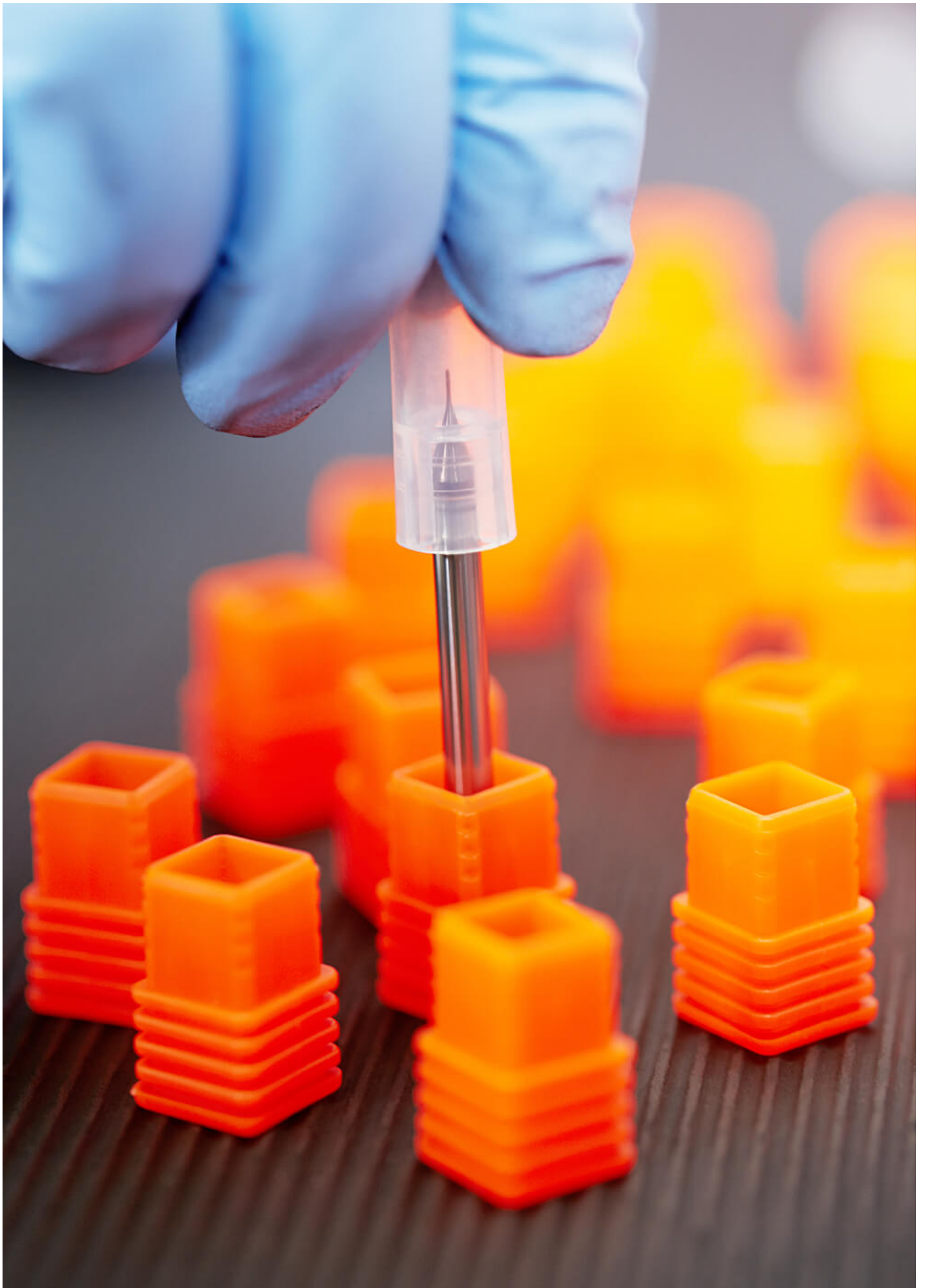
Ever smaller and more precise tools have highly complex requirements—homogeneous and smooth HiPIMS