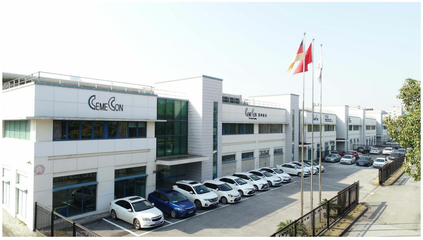
CemeCon has doubled the capacity of the premium coating center in Suzhou, China.